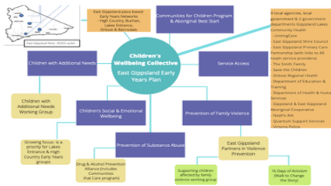
Diagram 1: Children with Additional Needs Working Group and its relationship to the Children's Wellbeing Collective (CWC).

The CWANWG identifies issues for children with additional needs and their families and how improvements can be made.